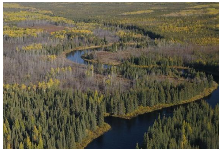
BISTCHO LAKE