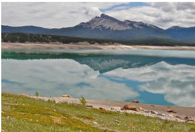
ABRAHAM LAKE

CPAWS Northern & Southern Alberta chapters have collaborated to call for the interim re-instatement of the policy and a return of coal leases to the government of Alberta. Our letter writing tool (launched in August 2020) recorded over 11,000 letters sent to the Minister of Energy and MLAs.