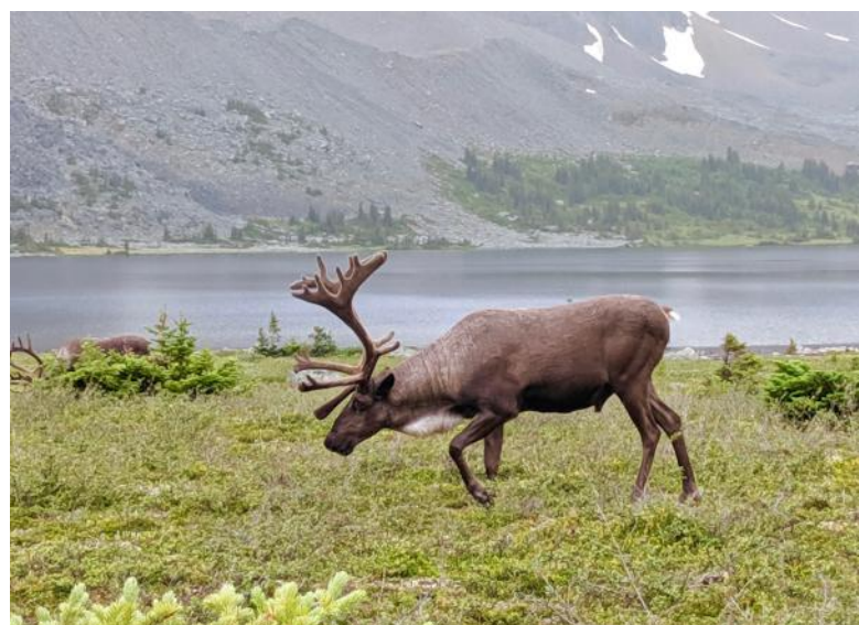
TONQUIN CARIBOU

The extirpation of the Maligne caribou herd from Jasper National Park was announced in 2020, calling into question actions needed to conserve the remaining caribou herds in the national park: the Tonquin, Brazeau, and A La Peche herds. CPAWS gave particular focus to the conservation of the Tonquin herd because of the more intense impacts from recreation and tourism activities that the herd experiences.