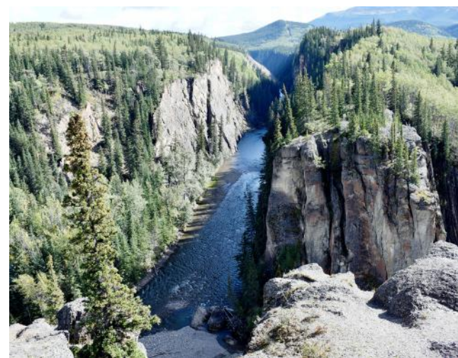
GRANDE CACHE

Many mining companies received exploration permits for their coal leases and developed hundreds of kilometers of roads and test drill pits, between the time the Coal Policy was removed (June 2020), and the Coal Policy's re-instatement and cancellation of exploration permits (February 2021).