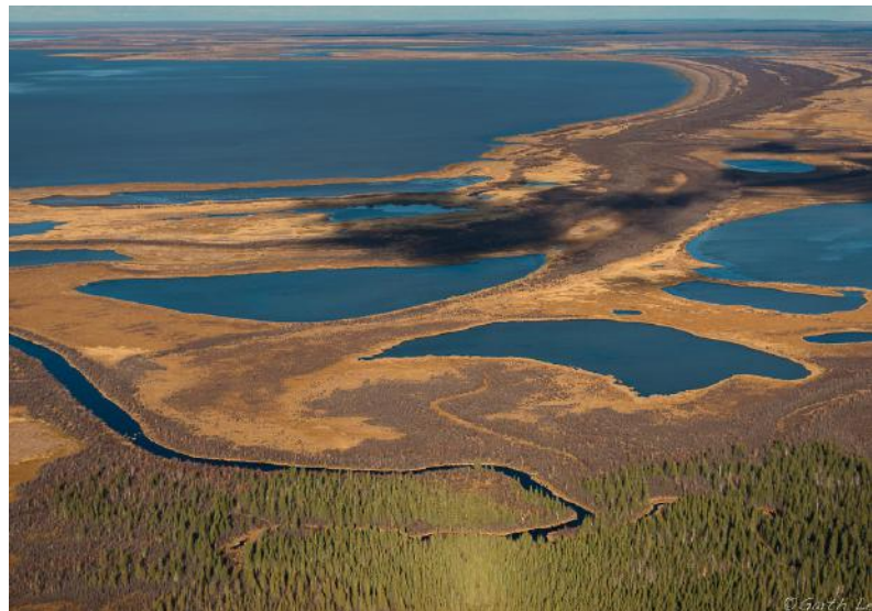
PEACE ATHABASCA DELTA, WOOD BUFFALO NATIONAL PARK

The possibility of listing Wood Buffalo National Park as a World Heritage Site In Danger was reviewed at the 44th World Heritage Committee meeting in July, 2021.