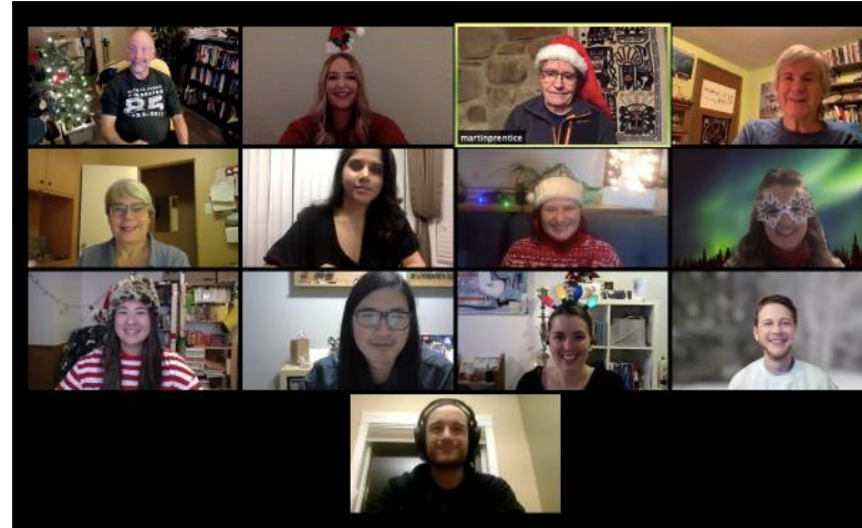
▲ Staff and Board Members attend our virtual Christmas party in 2020.