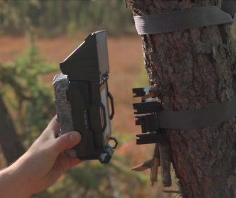
WILDLIFE MONITORING CAMERA

CPAWS Northern Alberta and the Dene Tha' First Nation (DTFN) have continued their collaboration with the Indigenous Guardians field data collection application. The smartphone-based App has been used to record hundreds of points of interest to the community and has been an important component to the wildlife monitoring program. In addition, the app has been used by the Nation for a joint project with our chapter examining the distribution of Bison within the Dene Tha' First Nation Traditional Territory. CPAWS Northern Alberta is excited to continue to work with the Nation and explore additional partnerships to advance conservation opportunities in Northwestern Alberta.