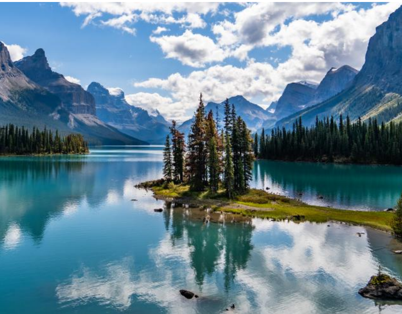
MALIGNE LAKE

Jasper National Park released their draft park management plan earlier in 2021 after delays due to COVID-19 in 2020. Public feedback on the plan was accepted from April 17 - July 7, 2021, and CPAWS Northern Alberta worked collaboratively with CPAWS National and CPAWS Southern Alberta to provide recommendations on how the plan could be improved and strengthened. We submitted a detailed 20-page report to the superintendent of Jasper National Park providing positive comments as well as feedback on areas that could be further improved