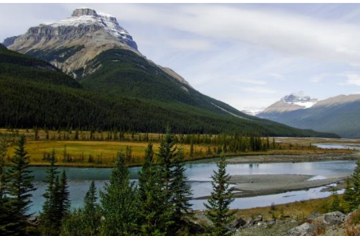
NORTH SASKATCHEWAN RIVER

The cancellation of the Coal Policy removed land zoning that restricted open-pit coal mining and coal exploration in some of Alberta's most environmentally sensitive areas. These areas provide Albertans, and much of the prairies, with drinking water and they are crucial habitat for species at risk such as grizzly bears, caribou, and native trout.