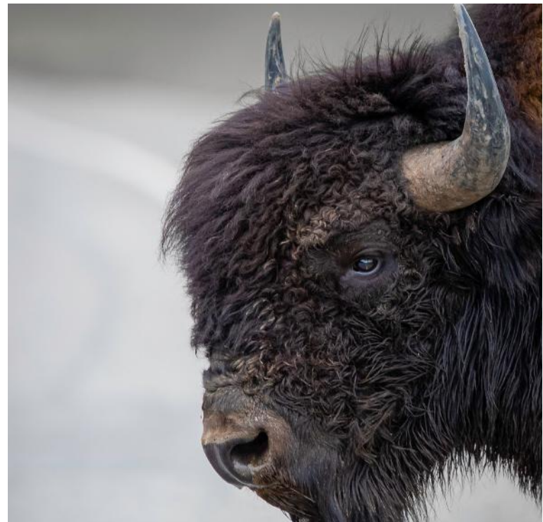
WOOD BISON

More can be learned about this work, and our broader bison conservation campaign, on our new webpage: https://cpawsnab.org/bison-in-alberta . For more information on ShagowAskee, explore https://shagowaskee.com/ .