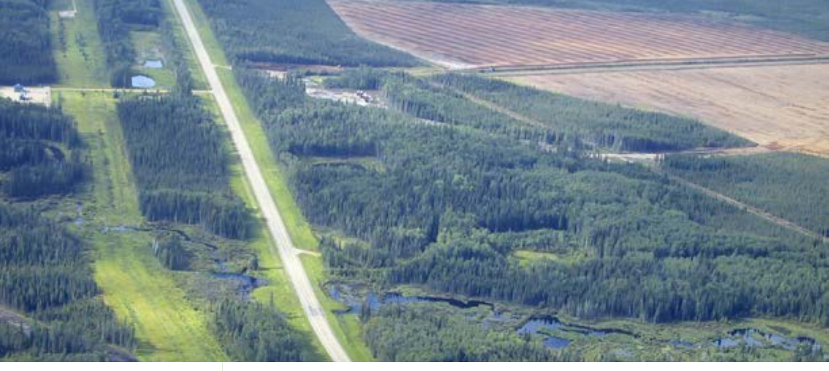
Cumulative Effects L. Foote